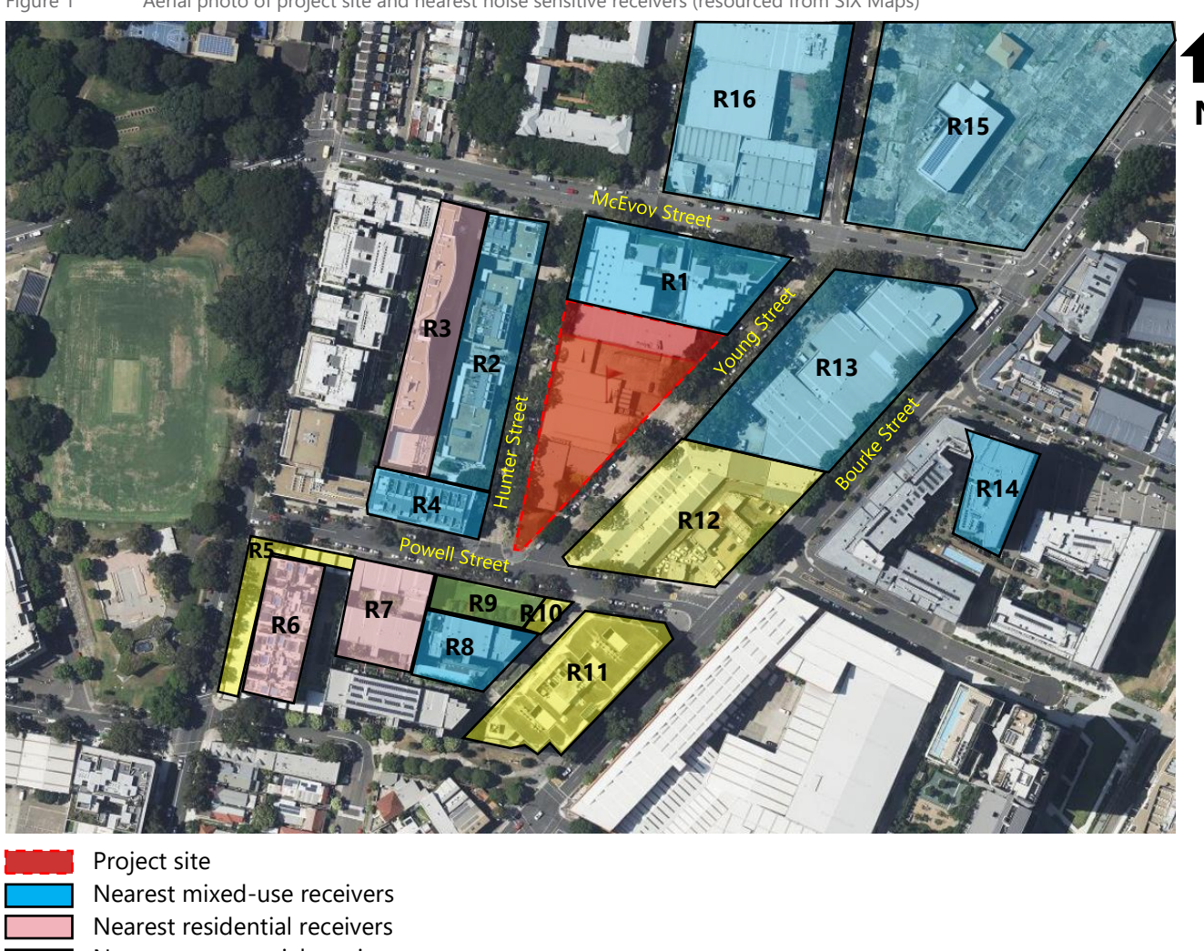
Figure 1 Aerial photo of project site and nearest noise sensitive receivers (resourced from SIX Maps)

Refer to Figure 1 for an aerial photo of the project site and nearest noise sensitive receivers.